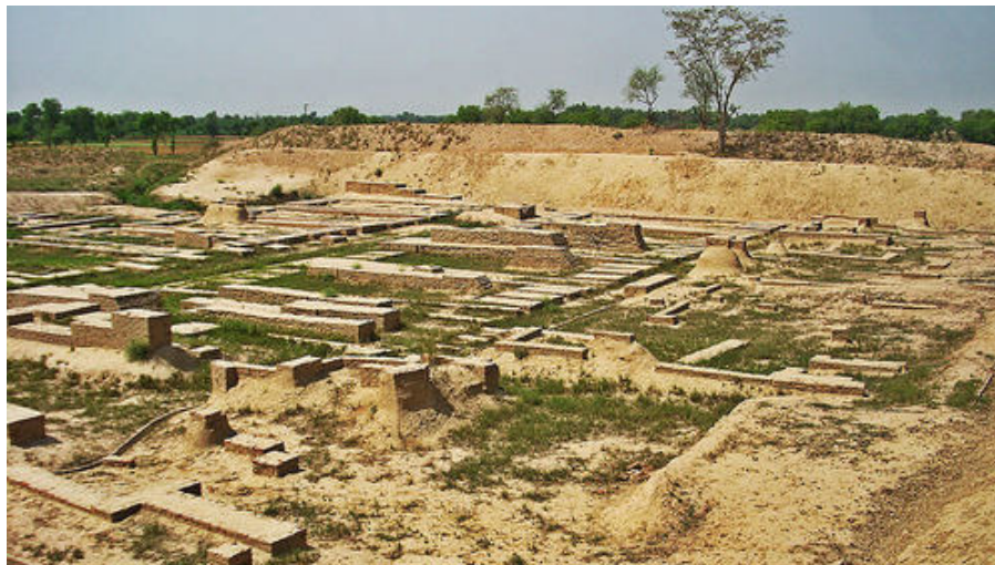
Fig. 1.3. Ruins of Mohenjo- Daro