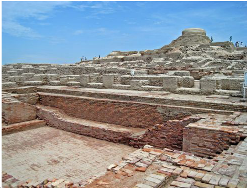
Fig.1.2. Excavation site at Mohenjo-daro

largest settlements of the ancient Indus Valley Civilisation. Mohenjo-Daro was an intricately developed city with streets spread out uniformly at right angles and a sophisticated drainage system. The Great Bath, a central structure at the site, was heated and seems to have been a focal point for the community. The residents were skilled in the utilization of metals, for example, copper, bronze, lead, and tin (as evidenced by artworks such as the bronze statue of the Dancing Girl and by individual seals) and cultivated barley, wheat, peas, sesame, and cotton. The trade of these agro-products was an important source of commerce of Mohan-jodaro.