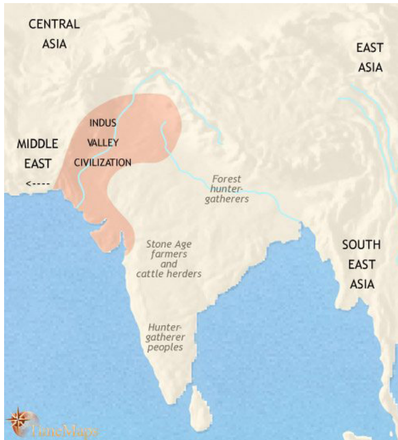
Fig. 1.1. History map of the Indus Valley civilization

civilisation falls under Neolithic (5000-1800 BCE). The matured stage of Harppan culture is also known as Indus valley civilisation and is estimated from 2600-1800 BCE. The Indus Valley Civilization is thrived in the basins of the Indus River, one of the significant waterways of Asia, and the Ghaggar-Hakra River, which once coursed through northwest India and eastern Pakistan. At its pinnacle, the Indus Civilization may had a population of more than 5,000,000. Occupants of the old Indus stream valley developed new methods in craftsmanship (carnelian items, seal cutting) and metallurgy (copper, bronze, lead, and tin). The Indus cities are noted for their urban planning, baked brick houses, elaborate drainage systems, water supply systems, and clusters of large non-residential buildings. After Indus valley civilisation Vedic age (1500-600 BCE) is very important in ancient Indian history. During this period rich evidence of Indian scriptures are developed. Rigved was the first Indian scripture of this period and after this three more vedas were composed. Harappa and Mohanjodaro are symbolic of two different civilisation of Indus valley. Among the settlements were the major urban centres of Harappa, Mohenjo-daro (UNESCO World Heritage Site), Dholavira, Ganeriwala in Cholistan and Rakhigarhi.